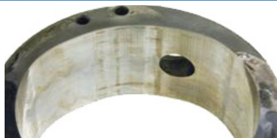
DENISON T6H20C Vane Pump Cam Ring